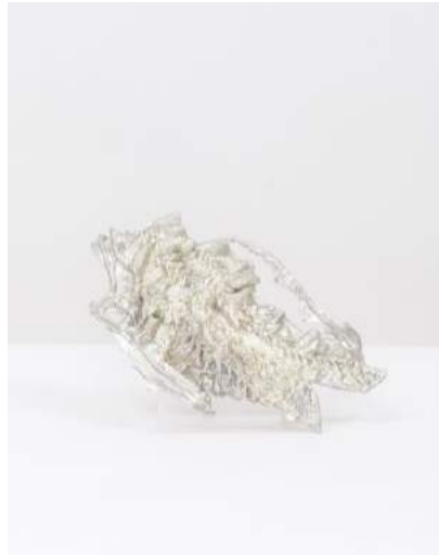
"flour, water", 2021, cast pewter, soapstone, 3 x 7 x 10 in.