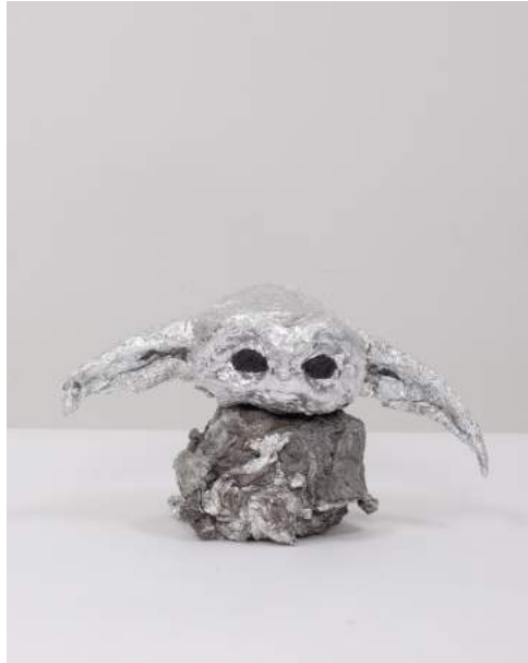
“Young Yoda”, 2018, aluminum foil