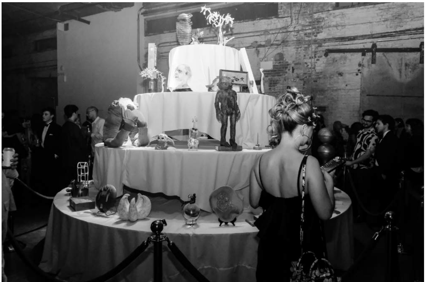
The auction table at Merde!, which held 64 sculptures.