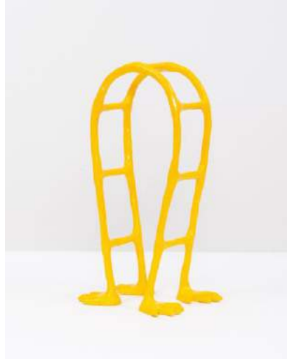
"Backbend", 2022, epoxy clay, paint, 6 x 6 x 14 in.