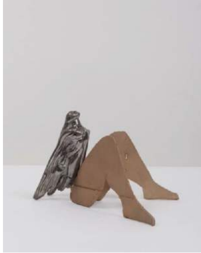
"Paper Doll #3", 2021, hood ornament and bronze, 6 x 9 x 6 in.