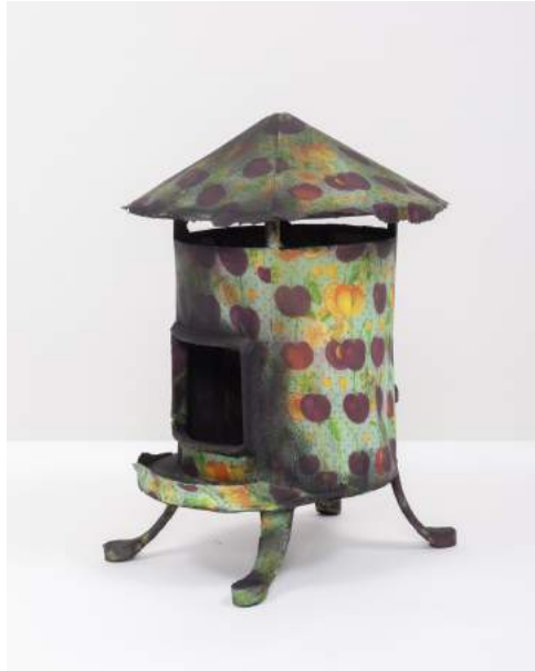
"Cherry Stove", 2022, newsprint, steel, charcoal, 10 x 10 x 15 in.